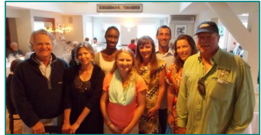
Pre-Event Dinner: The Chilmark Tavern

Transportation: Budget Martha's Vineyard